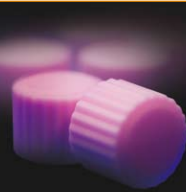
Patented Gripple ceramic rollers