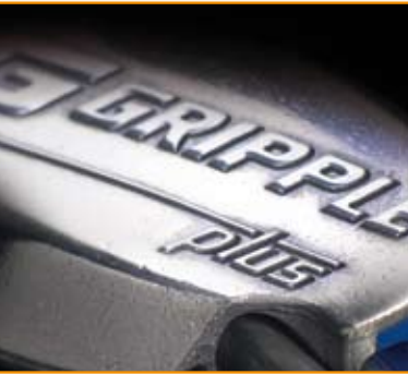
The New Gripple Plus

The NEW Gripple Plus range is now complete! WARATAH released the Gripple Plus Medium earlier this year and now the Gripple Plus Large has arrived. Familiarise yourself with the features and benefits of the new range and some of the changes that have been made to improve the Gripple Plus.