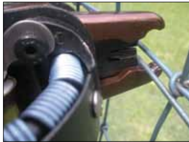
2. Press jaws against wire.