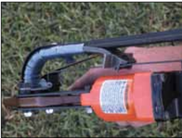
1. Load with clips.