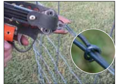
3. Press trigger and ring will close around wire.

Recommended for use with the Waratah pneumatic clip gun